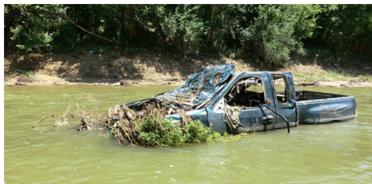
Approximately 80% of aquatic trash comes from land-based sources.

The TFW program promotes actions and projects that are results-driven, measurable, and achievable. A common problem when implementing and executing a TFW project is developing data that support a measurable result. In a given action or project, examples of data that can be quantified are: Reduction in the number of plastic bottles/bags used per unit of time; Amount of money saved; Labor hours saved; Mass or volume of trash prevented from going into a landfill or water body; Number of storm drain overflows; Number of littering citations; Volume or percent of trash recycled or otherwise diverted; Number of participants; and/or Mass or