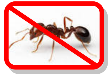
Red Imported Fire Ant