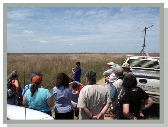
Above: Refuge visitors learn about radio tracking Attwater’s prairie chickens.